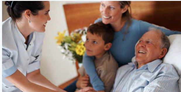
We take pride in recruiting caregivers who support our goal: "To offer caregiving services that deliver the best in value, reliability, and quality in the communities we serve."

Family Caregivers provides certified and credentialed Personal Care Attendants within the comfort of one's home to assist with the activities of daily living.