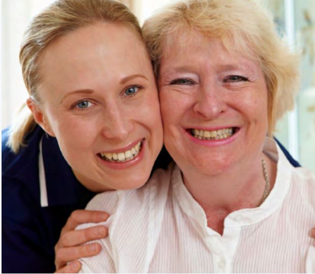
Family Caregivers provides caring, compassionate, practical and high-quality, non-medical support services.

Family Caregivers has a wide range of certified Personal Care Attendants, provided to persons with disabilities and chronic conditions which enables them to accomplish tasks that they would normally do for themselves.