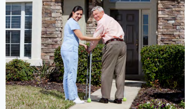
Personal care services with integrity and dedication to your loved ones.

Hands-on activities of daily living might include assisting with dressing/undressing, bathing, or transferring.